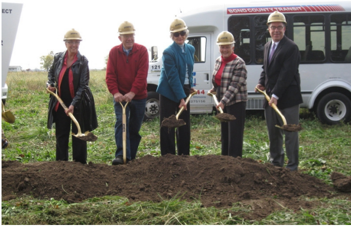
City and County leaders