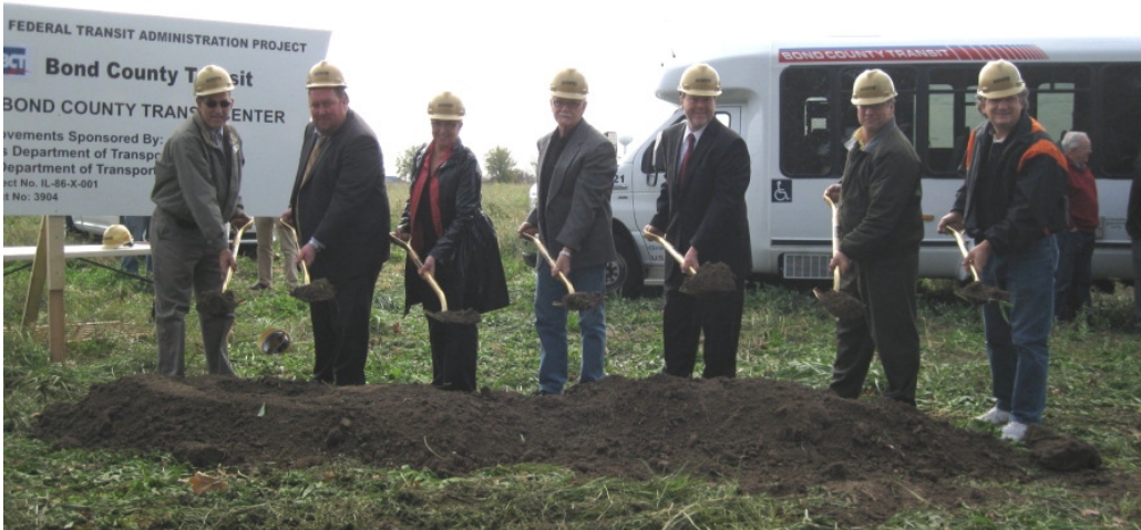
Bond County Transit Staff and Regular Riders