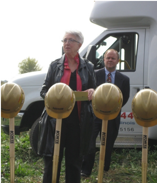
The Korte Company, Tindall Construction, Bond County Senior Center Director and Chairman of the board